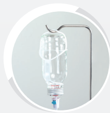
IN BUILT PERISTALTIC PUMP